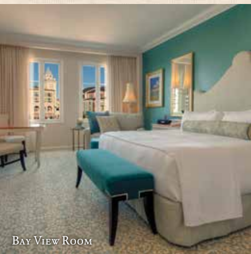
BAY VIEW ROOM