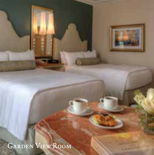
GARDEN VIEW ROOM